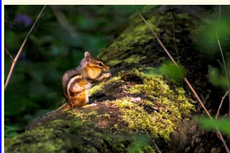
Emily Green Adult First Place “Chippy the Chipmunk”