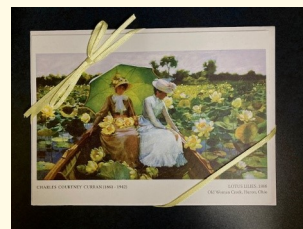
Curran note cards