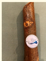
Hiking stick medallions

These are just a few of the nature related items you can find at our Gift Shop which is open whenever the visitor center is open. December hours are Tuesday thru Friday. 9 a.m. to 4 p.m.